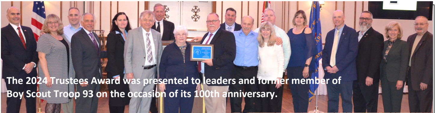
The 2024 Trustees Award was presented to leaders and former member of Boy Scout Troop 93 on the occasion of its 100th anniversary.